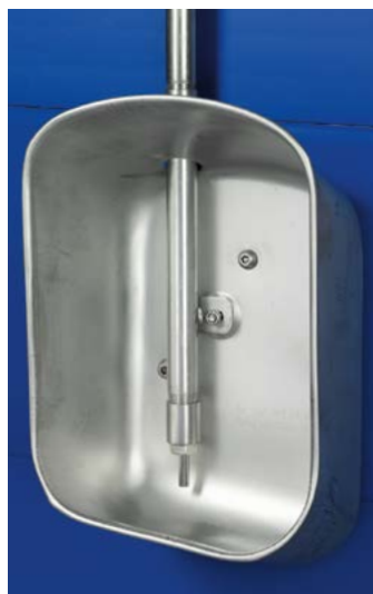
Drinking bowl for finishing pigs