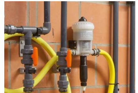
Medicator type 3 (acid-resistant)