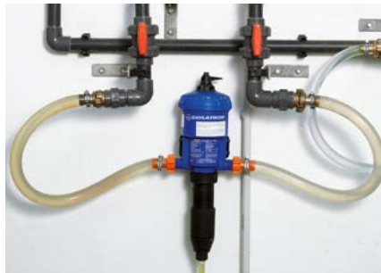
Medicator type 1