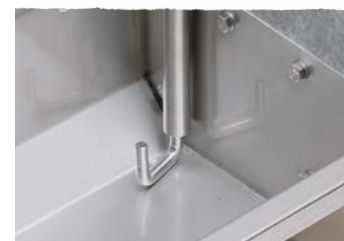
Vacuum trough flooding tube with J-shaped agitator for longitudinal troughs

The vacuum trough flooding tube is used for sows in stalls or piglet rearing houses. Water is automatically replenished when the pigs drink from the trough. The longer the row of troughs (max. 25 m per trough flooding tube), the more economic is this type of drinking system.