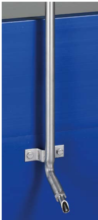
Nipple drinker for piglets