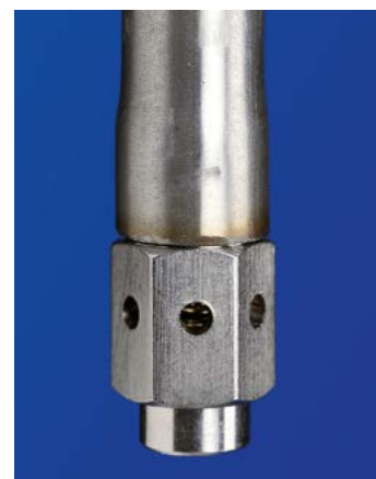
Trough sprayer for sows – high pressure

Optionally available are drinking tubes with guard, which may also be retrofitted. The guard keeps the pigs from getting hurt at the nipple drinker, for example when moving out ready-for-slaughter finishing pigs.