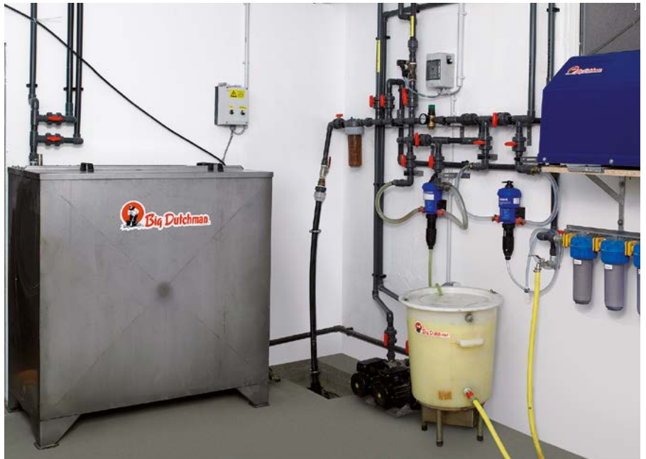
Service room with small (60 l) and large (1000 l) stainless steel medicine mixing tank

Liquid medicines are extracted directly from their original packaging. In case of pulverized or viscous materials, a medicine mixing tank with a rotary vane pump (60, 180 or 210 l) should be used.