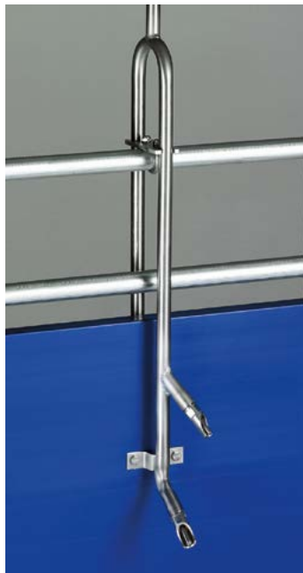
Drinker tube for simultaneous supply of two pens

In addition, Big Dutchman offers a drinker tube for the supply of two pens with a total of four nipple drinkers (two in each pen).