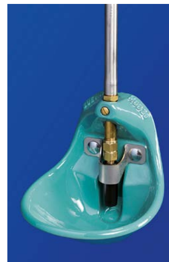
Drinking bowl with valve guard for farrowing pens