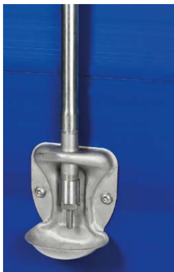
Drinking bowl for suckling pigs