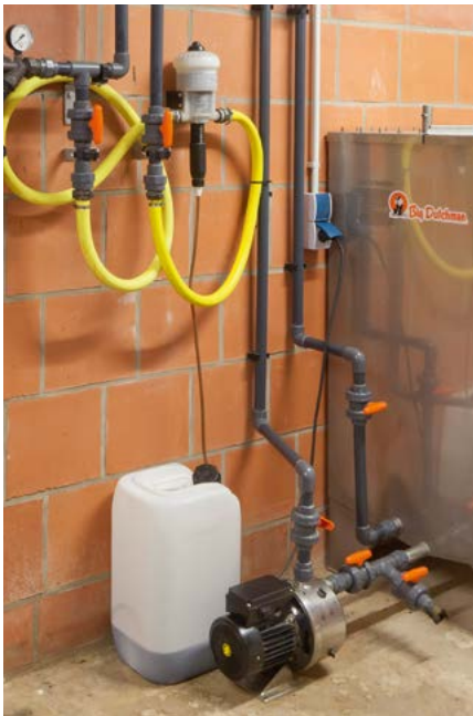
Liquid medicines are sucked in directly