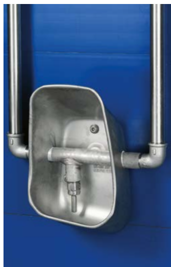
Drinking bowl with water circulation for weaners of up to 35 kg