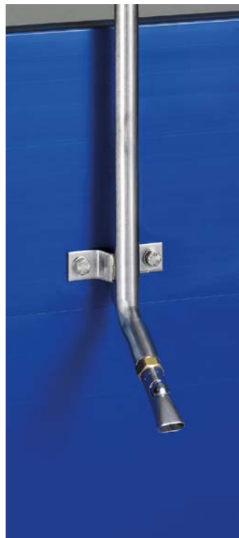
Nipple drinker for finishing pigs with bite ball