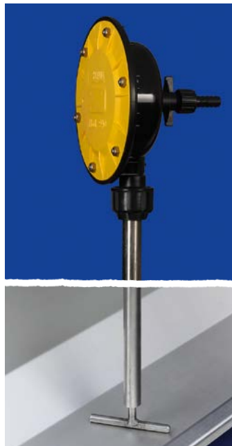
Vacuum trough flooding tube with T-shaped agitator for longitudinal troughs – high pressure

operator to simply flush all pipelines after the use of medication. The circulation tube can also be used for drinking bowls.