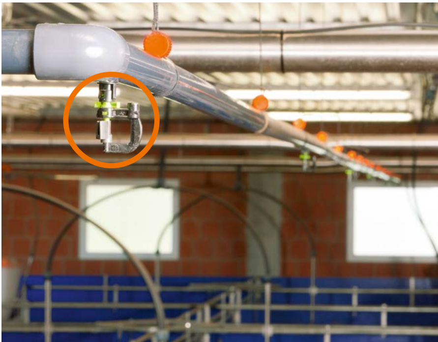
Stationäre Einweicheanlage in einem Mastabteil für die professionelle Stallreinigung

The soaking aid with control unit offered by Big Dutchman simplifies the cleaning process and significantly reduces the cleaning time after each grow-out, thus saving time. Furthermore, the amount of water later required for high-pressure cleaning is less. Spraying and pause intervals of the soaking nozzles can be adjusted individually (depending on the degree of contamination) by means of control via an electric solenoid valve installed inside the main water supply. Thanks to the flexible suspension system, damage caused by the water jet of the high-pressure cleaner can be prevented. The system can easily be adjusted to the house dimensions.