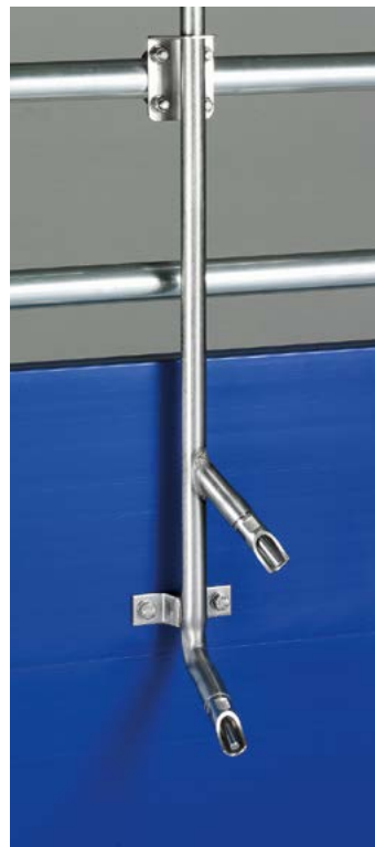
Nipple drinker for finishing pigs