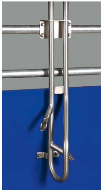
Drinker tube with water circulation

To prevent deposits of vitamins or minerals in the drinker tube, a circulation tube for water circulation is included in our product range. This permits the